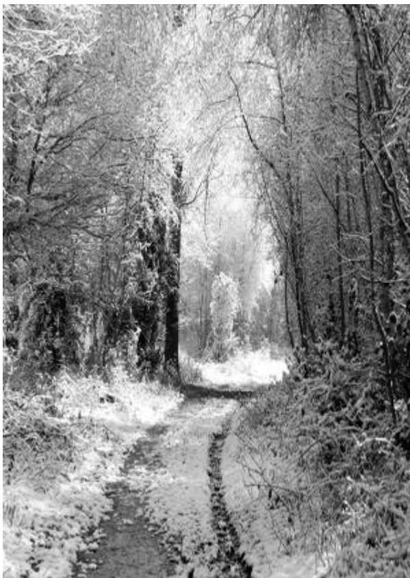
Box Hill, Surrey